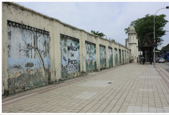
The wall said it all: "Wreck in Pieces 1895 -2010"

My disappointment was further aggravated by people with 'extra-intelligence' specialised in the supernatural field of horrendous belief - Fragments of stone from the demolition of Pudu jail were believed to bring luck to gamblers in striking the lottery jackpot. It seems Pudu jail ghost stories circulated for years were not enough to embarrass ourselves. Just because it was a prison with a hundred year of history, we naturally allow our creative imagination to run wild. How mature is that. Anyway, just to let you know, many had died thousands and millions of years ago at where you are now. Feel free to scream or grab your hair.