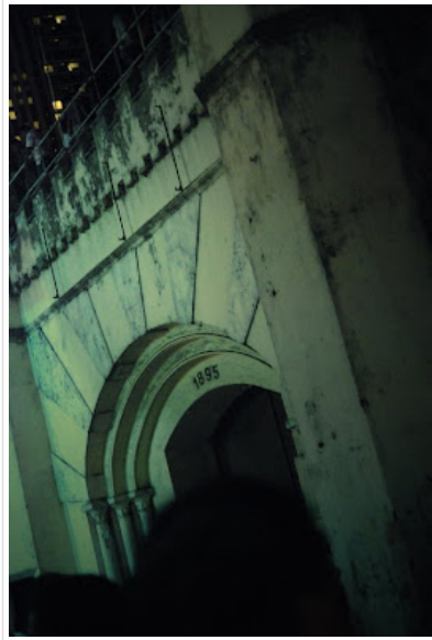
What you see is now what you get (by Chan Wai Hoe)