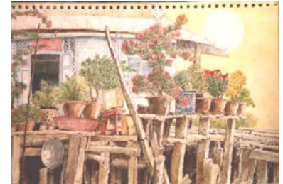
Green Decoration - 1996 - 26.5x36.5cm (Private collection)

2004-2005 > Guest Cartoonist of Nanyang Siang Pao Daily Forum, Malaysia.