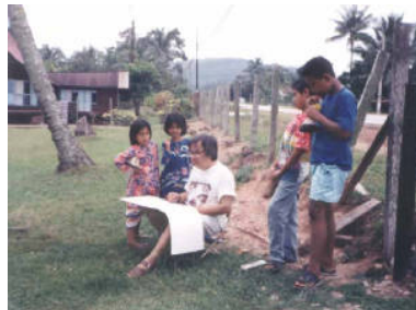
Outdoor sketching at a roadside Malay's village

Most of my works are related mainly to the rustic, noisy, yet colorful and exciting environment which I grew up in. They are now fading away as we approach the twenty-first century. I hope that my works can serve as a form of social documentation for this fast changing world. They may help us remember the past, to appreciate the present, and to look forward to the future.