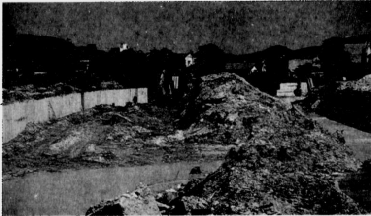
PROGRESSING AS SCHEDULED ... river widening work at Sungai Batu.