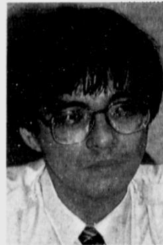
TAN ... prevent overflow

"As a result, the river capacity will be increased and overflowing will not occur easily."