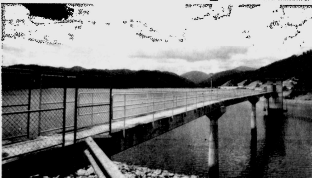
BATU DAM... ideal venue for water sports activities because of its calm water.

He was also involved in a similar exercise prior to the 1990 Asian Games in Beijing.